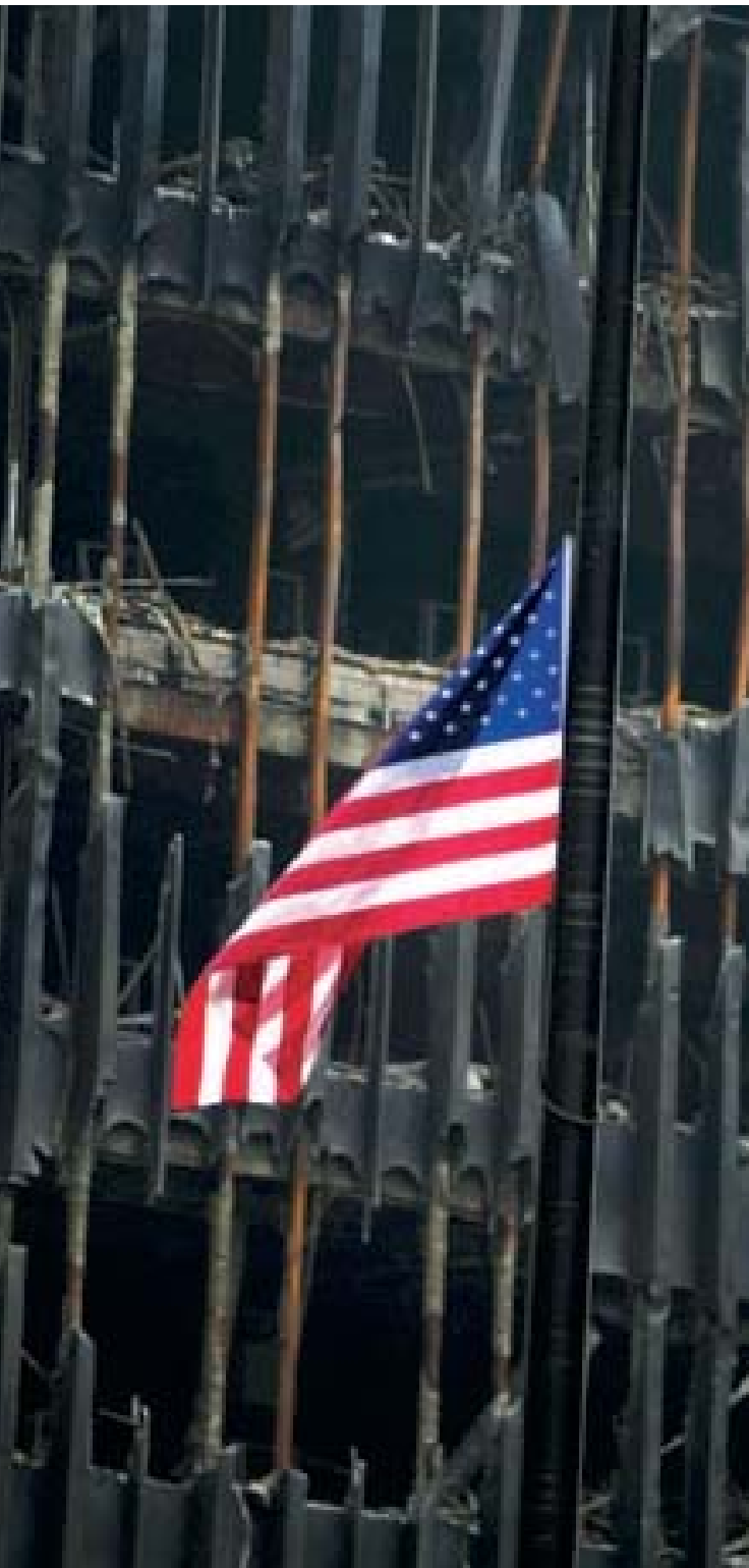
Above: Half-mast – an American flag in the ruins of the World Trade Centre.

One news story dominated last year: the attack on the World Trade Centre, the collapse of the Twin Towers and the subsequent conflict in Afghanistan. On 11 September, BBC News was the nation's first choice as people sought to learn what had happened and to make sense of it all.